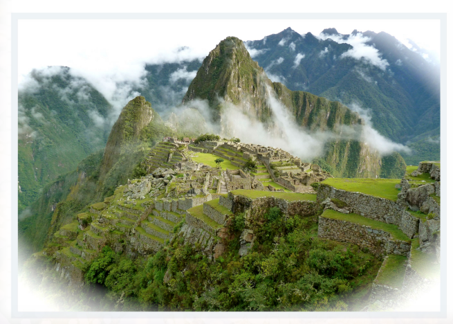
Sur les traces des Incas